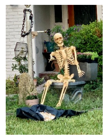
The Scary Skeleton