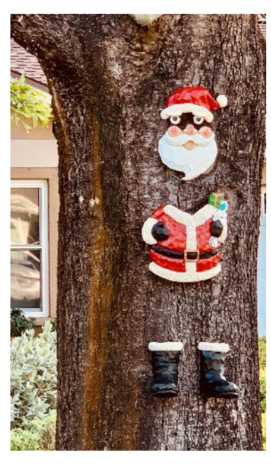
The Scruffy Santa