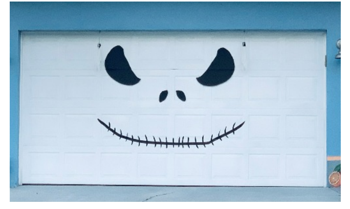
The Garage Ghoul