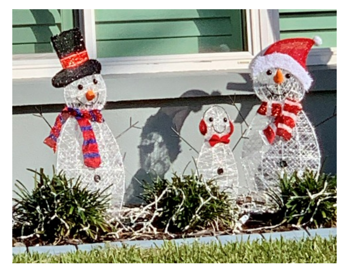
The Frolicking Family