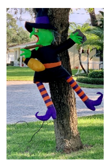
The Wacky Witch