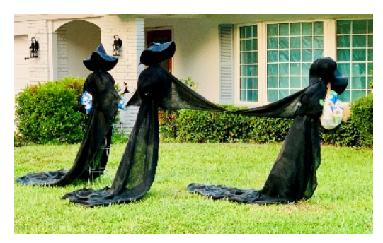
The Wretched Witches