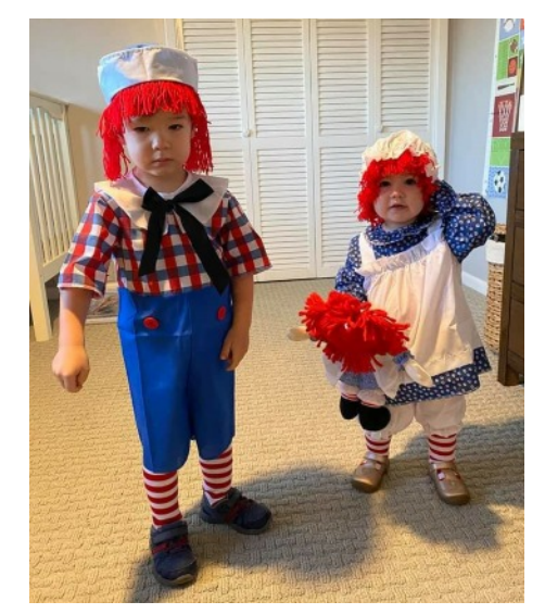
The Redheaded Raggedy Ann & Andy

In case you missed the wonderful holiday decorations displayed by our neighbors, here are some of the highlights. More photos are in the online version.