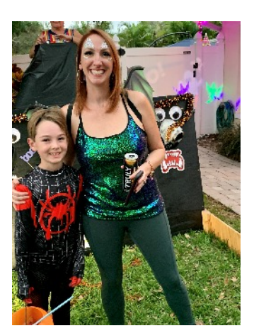
The Perfect Pair