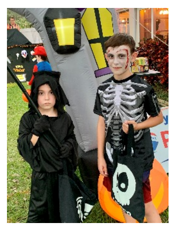
The Dynamic Duo