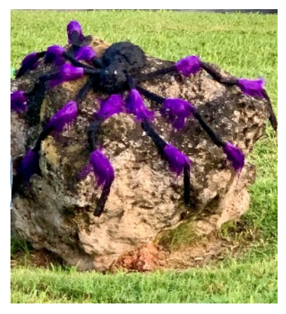
The Spooky Spider