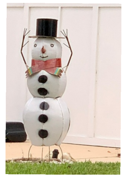
The Saluting Snowman