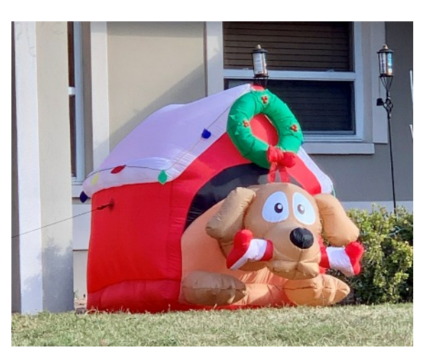
The Peppermint Puppy