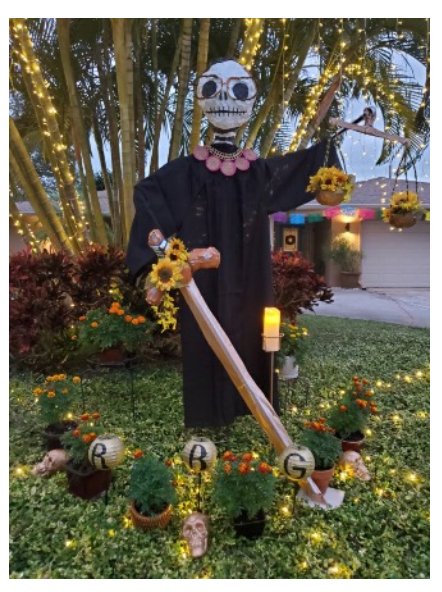
The Renowned RGB