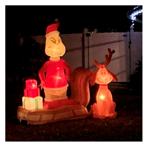
The Glaring Grinch