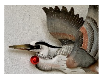
The Holiday Hero