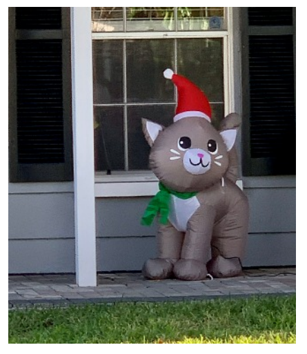
The Christmas Cat