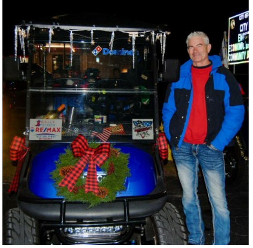
The Gregg Dixon Great Golf Cart