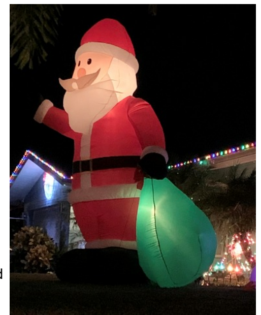
The Super-sized Santa