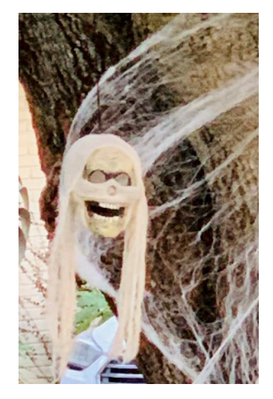
The Ghastly Ghoul