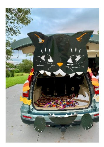
The Cat Car