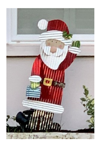
The Shimmery Santa