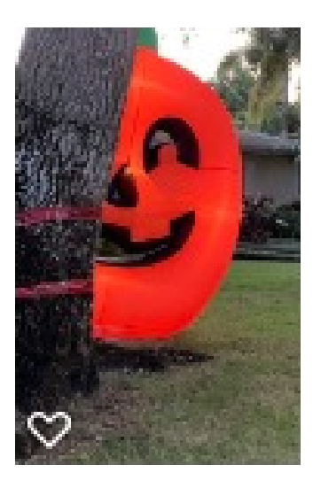
The Peek-a-boo Pumpkin