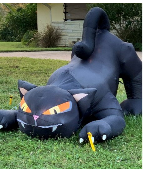
The Beastly Black Cat