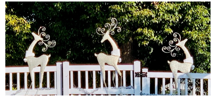
The Rollicking Reindeer