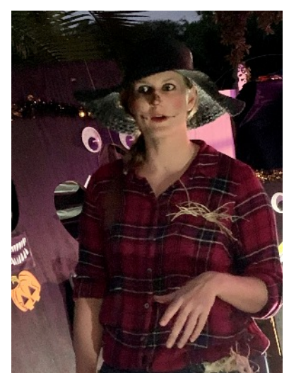
The Hapless Hobo