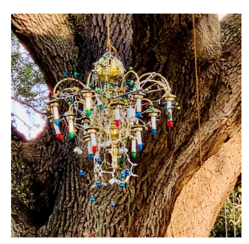
The Joyous Jellyfish Unlit