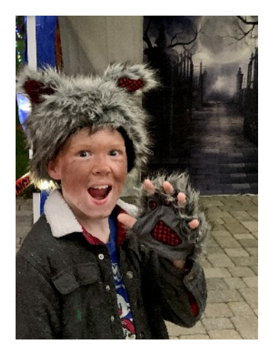
The Wiley Werewolf