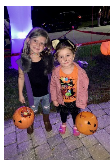
The Glowing Girls