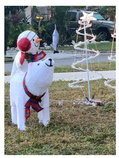
The Fishing Friends