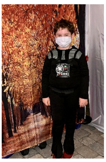
The Masked Marvel