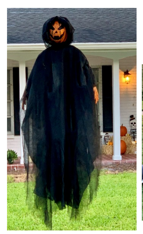
The Perilous Pumpkin