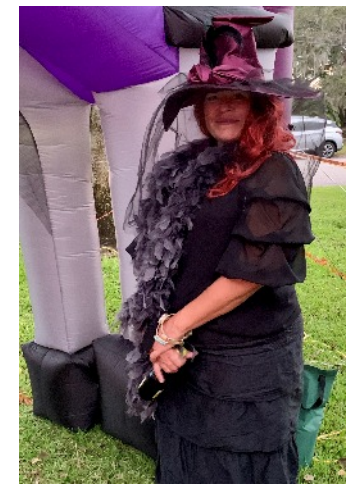
The Seductive Sorceress