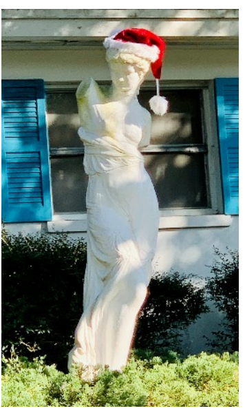
The Santa Statue