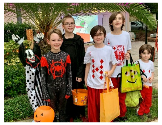
The Kinetic Kids