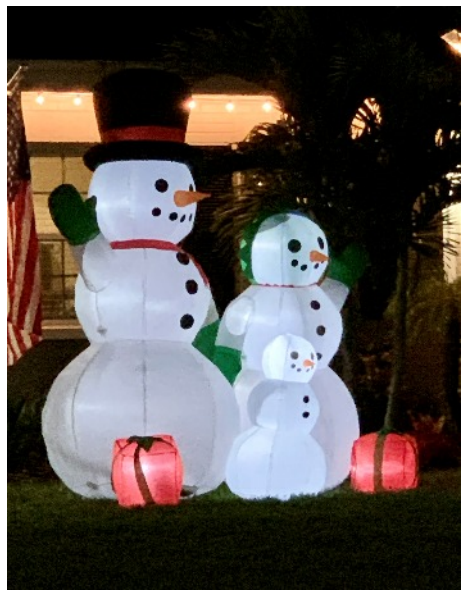
The Frosty Family