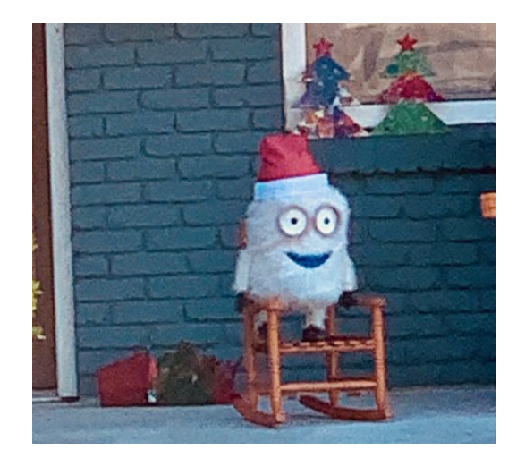
The Screwball Santa