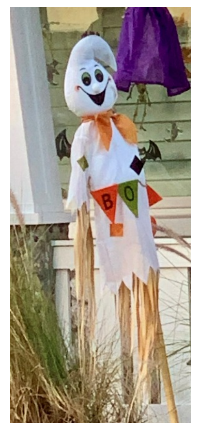
The Giddy Ghost