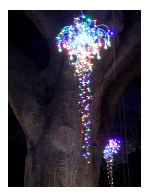
The Joyous Jellyfish Lit