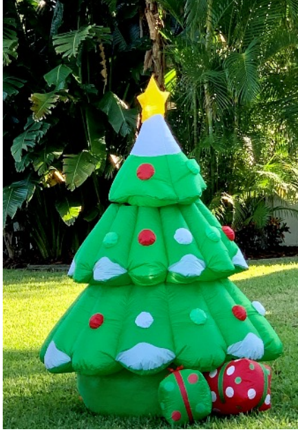
The Cuddly Christmas Tree