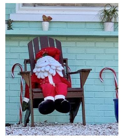
The Sleepy Santa