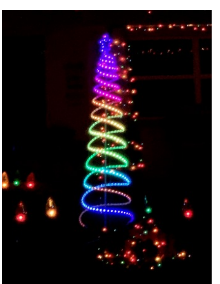
The Tantalizing Tree