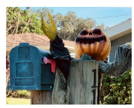
The Menacing Mailbox