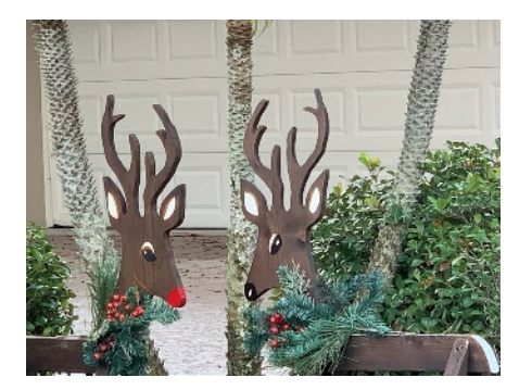
The Romantic Reindeer