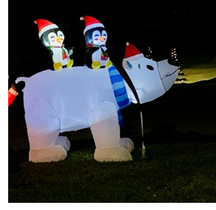
The Precious Pals