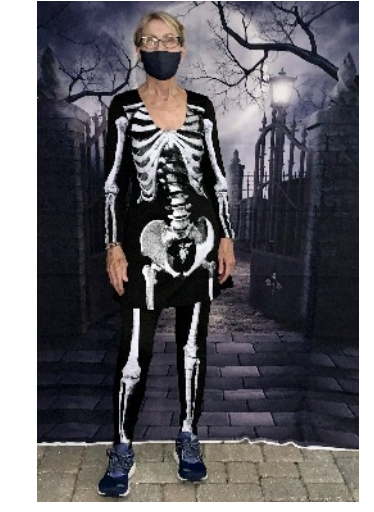
The Stately Skeleton