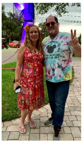
The Colorful Couple