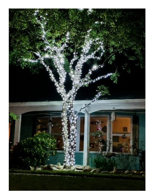
The Bright Branches