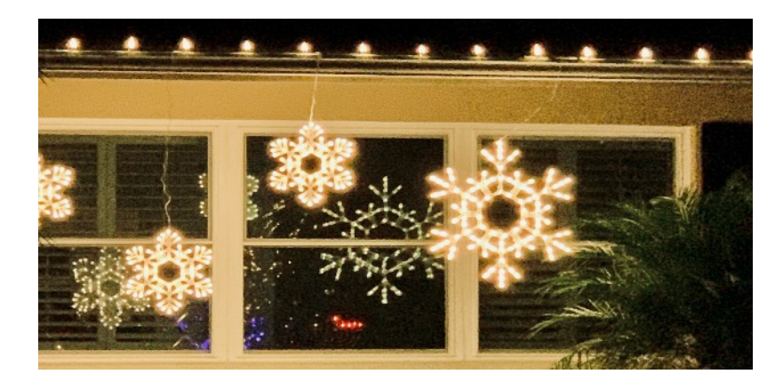
The Sparkling Snowflakes