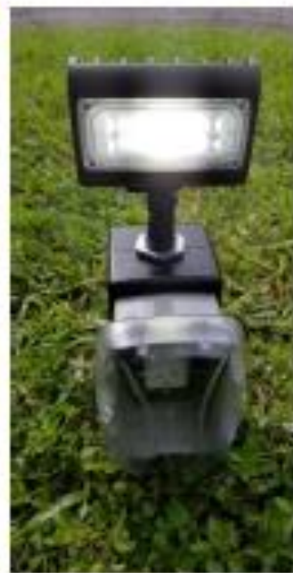
Additional Outlet in center island of Palm Blvd:

To open outlet cover ... pull forward from bottom It feels stiff (they're weatherproof), but will eventually give ☺