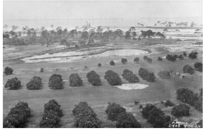
Dunedin Golf Course 1926

Ross courses are known for a naturalness where the lay of the land dictates what each hole should be. He preferred clear, open routes that require little walking, but often precise shots like those needed on his crowned or "turtleback" greens. He wanted each hole to present a different problem that commands the golfer's full concentration.