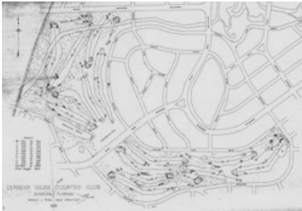
Golf course, and neighborhood, plan

Ross honed his skills in native Scotland at St. Andrews where he learned modern greenkeeping, course care and design. In 1900 Ross took a job at the Pinehurst resort in North Carolina. He designed and built four courses at Pinehurst, the jewel being the famous No.2. Considered to be his signature creation, it was the first course to host the men's and women's U.S. Open in the same year. Ross lived in a cottage behind the third green where he did much of his design work. His vast knowledge of turf grass management and greenkeeping revolutionized the field of golf course design, including the use of Bermuda grass on the greens.