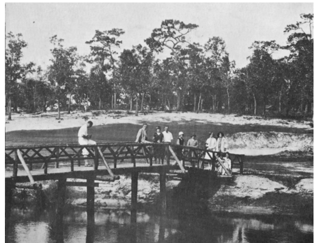
Dunedin Golf Course bridge at 11 th hole

Although Ross did not visit many of the courses he designed, he did visit Dunedin and called the site "among the most naturally beautiful and suitable for golf" he had ever seen. Built mostly by laborers with mule-powered equipment, the Dunedin course opened January 1, 1927. Playing the course in its first year, pro Tommy Armour said it was "the best in Florida, perhaps the entire country." It would briefly become home to the PGA, a move that gave rise to Fairway Estates where, ideally, pros would build winter homes near the course. That never came to fruition although top players Tommy Armour, Bobby Jones, Gene Sarazen, Sam Snead, Ben Hogan and Byron Nelson played the course and their names now grace our streets.