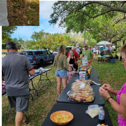
Neighbors survey the treats