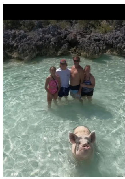
The Burbine family swimming with pigs in Exuma, Bahamas