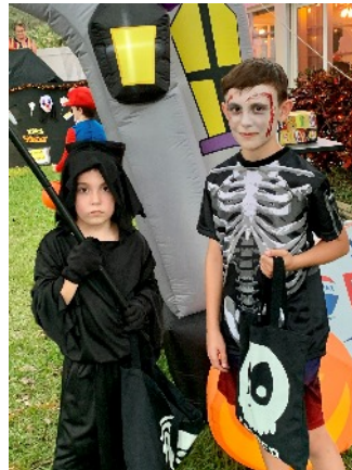
The Dynamic Duo