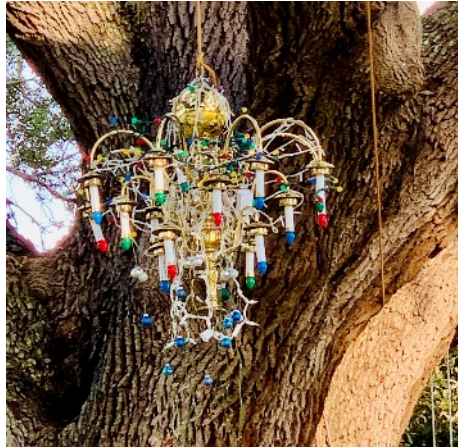
The Joyous Jellyfish Unlit