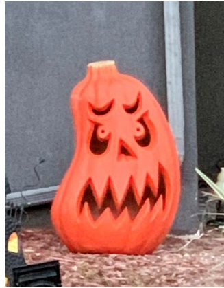
The Peeved Pumpkin