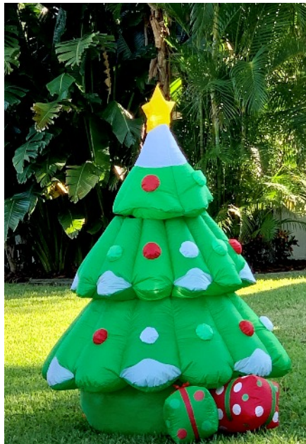
The Cuddly Christmas Tree