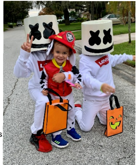
The Musical Marshellos and Fiery Fireman