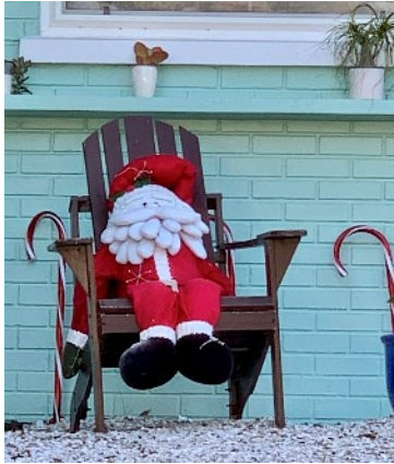
The Sleepy Santa