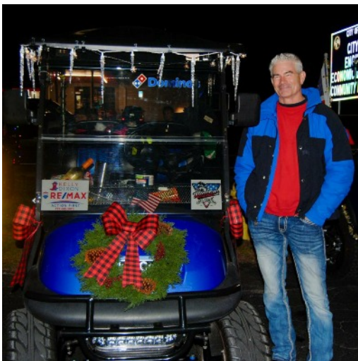
The Gregg Dixon Great Golf Cart