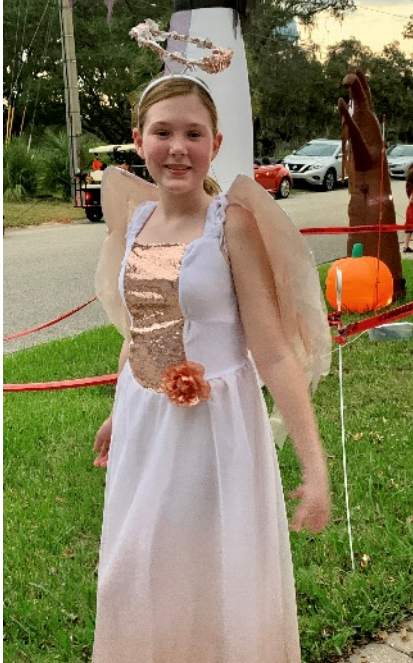
The Angelic Angel