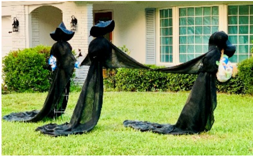
The Wretched Witches