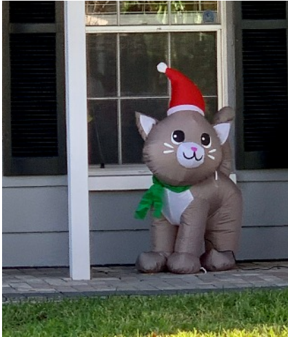
The Christmas Cat