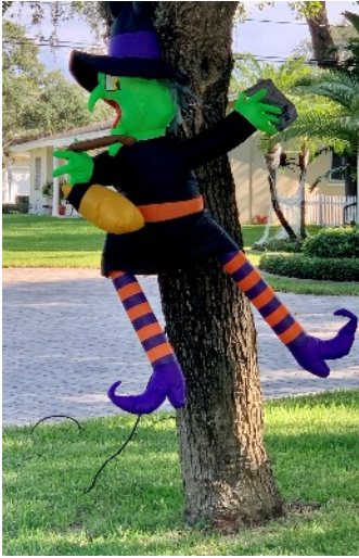
The Wacky Witch