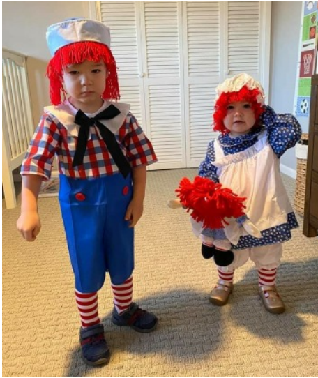
The Redheaded Raggedy Ann & Andy

In case you missed the wonderful holiday decorations displayed by our neighbors, here are some of the highlights. More photos are in the online version.