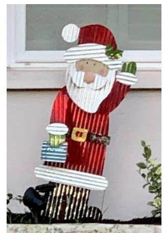
The Shimmery Santa