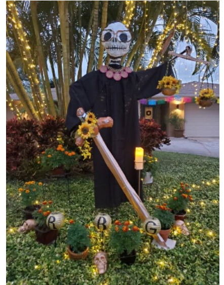
The Renowned RGB