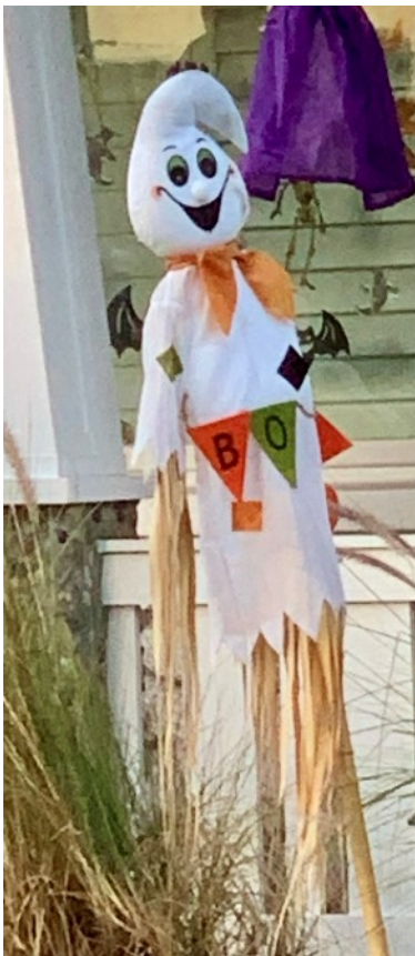
The Giddy Ghost