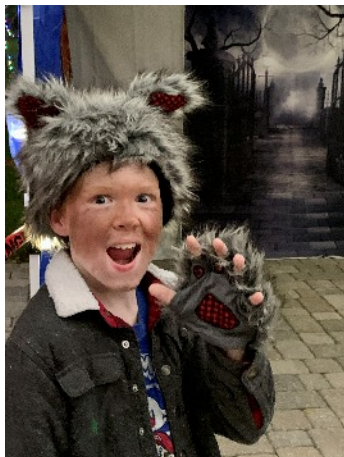
The Wiley Werewolf