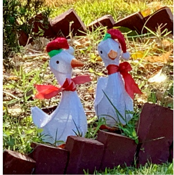
The Dainty Ducks