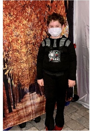
The Masked Marvel