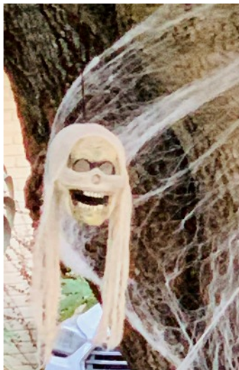
The Ghastly Ghoul