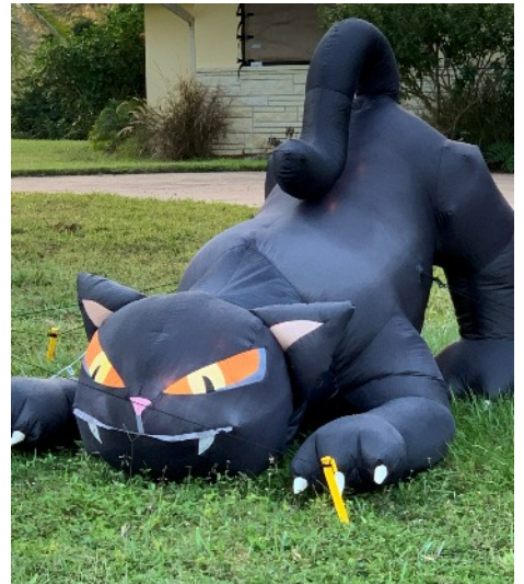
The Beastly Black Cat