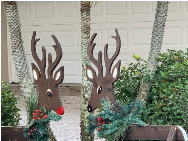
The Romantic Reindeer