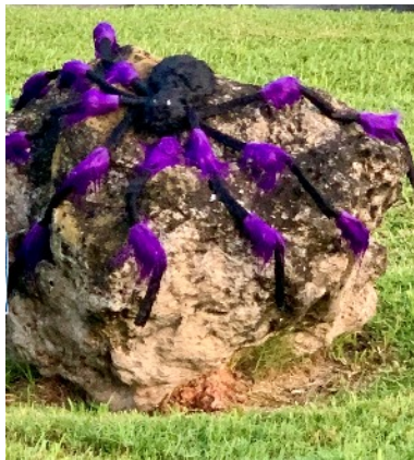
The Spooky Spider