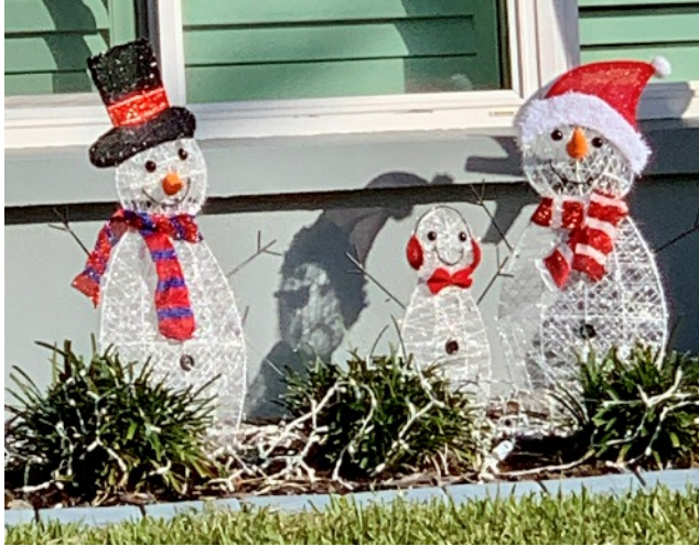
The Frolicking Family