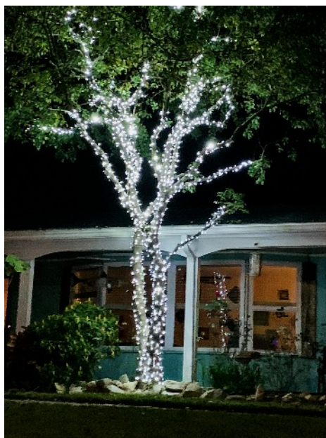
The Bright Branches