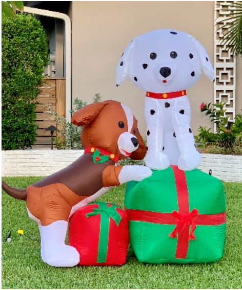
The Delightful Dogs