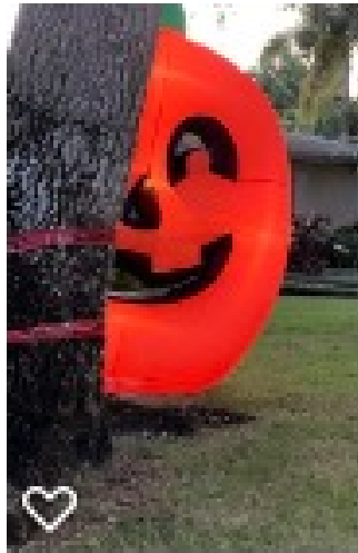
The Peek-a-boo Pumpkin