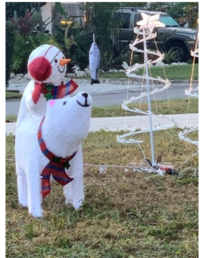
The Fishing Friends