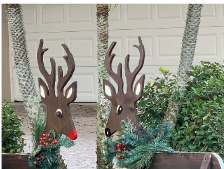
The Romantic Reindeer