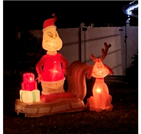
The Glaring Grinch