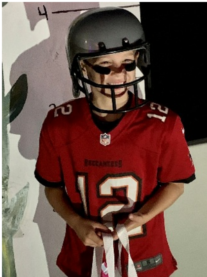
The Talented Tom Brady