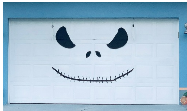
The Garage Ghoul