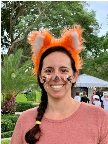
The Tabby Tiger