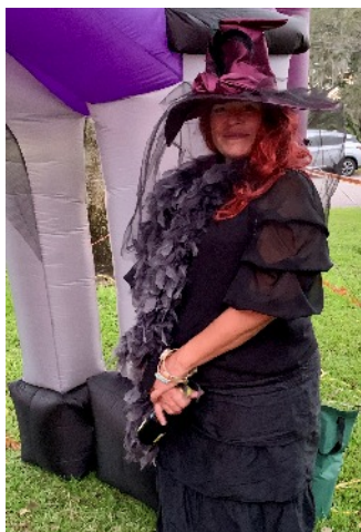
The Seductive Sorceress