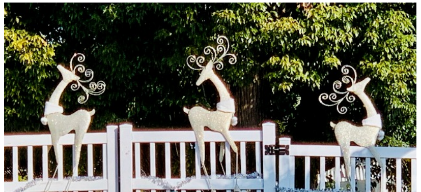
The Rollicking Reindeer