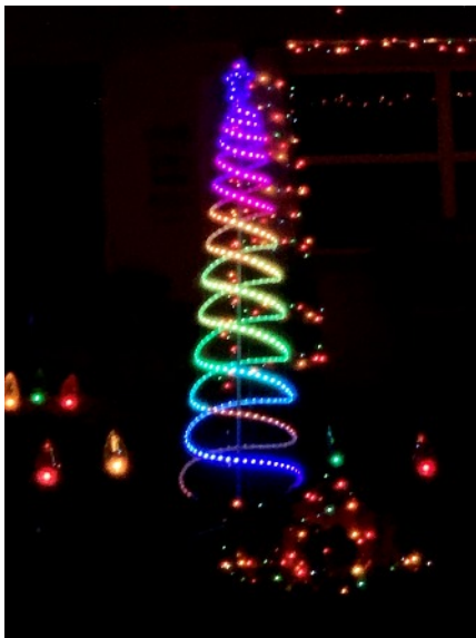
The Tantalizing Tree