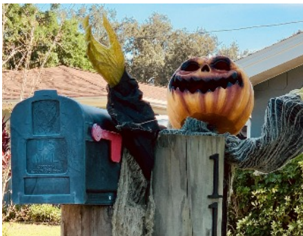
The Menacing Mailbox