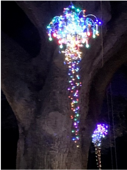
The Joyous Jellyfish Lit