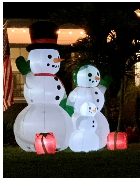
The Frosty Family