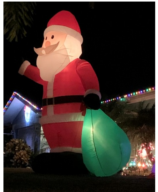
The Super-sized Santa