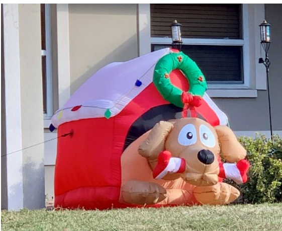
The Peppermint Puppy