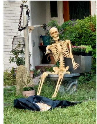
The Scary Skeleton