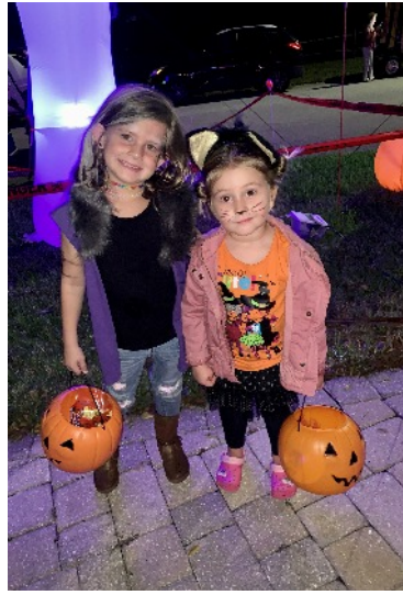
The Glowing Girls