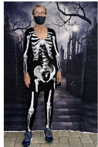
The Stately Skeleton