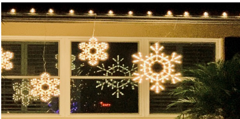
The Sparkling Snowflakes