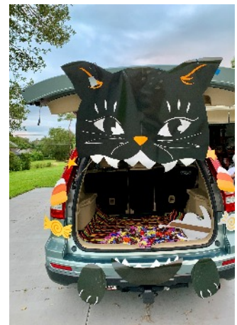
The Cat Car