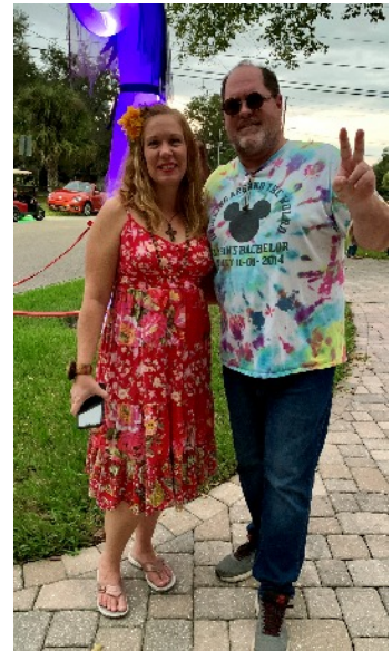
The Colorful Couple