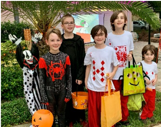
The Kinetic Kids