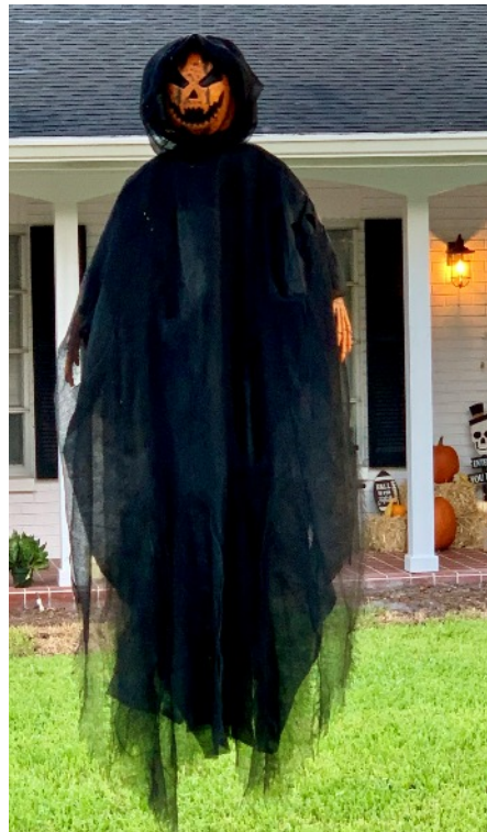
The Perilous Pumpkin