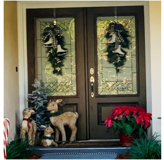
The Warm Welcome