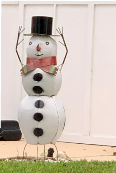
The Saluting Snowman