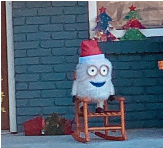
The Screwball Santa