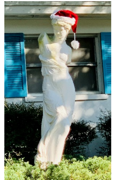
The Santa Statue