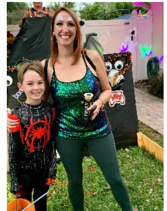
The Perfect Pair