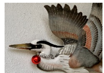
The Holiday Hero