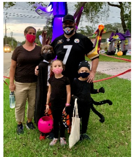
The Fab Family