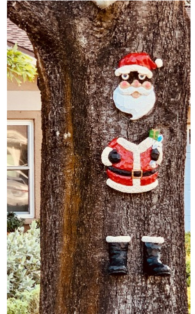
The Scruffy Santa