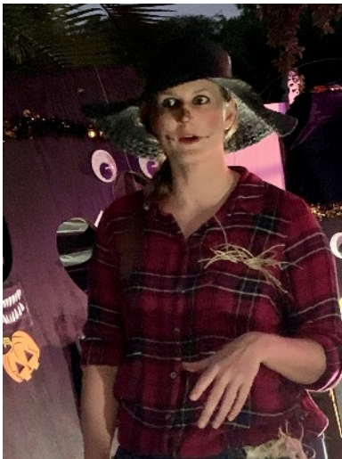
The Hapless Hobo