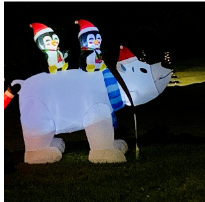
The Precious Pals