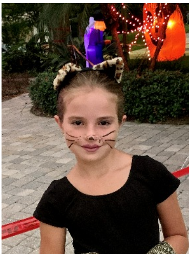
The Cutie Cat