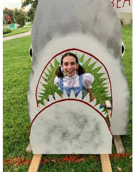
The Defenseless Dorothy