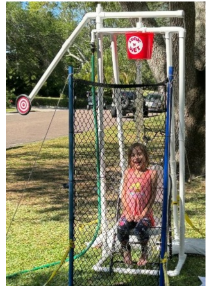
Nothing better than a legitimate excuse to get water dumped on your head!