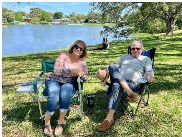
Enjoying the day!