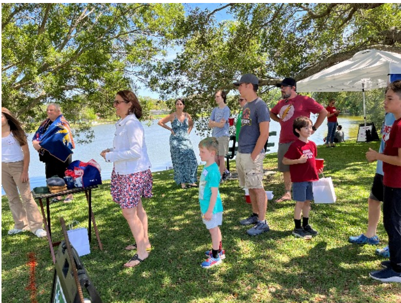
We are learning something about our neighbors when we realize they are more than enthusiastic to stand in line to throw bean bags at someone in order to drench them in water.