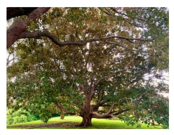
Hi, Let me introduce myself. I am probably older than you think, possibly the oldest magnolia tree in Dunedin, and have seen many changes over my lifetime so far. Will you give me a name? To help you out, here is my story.