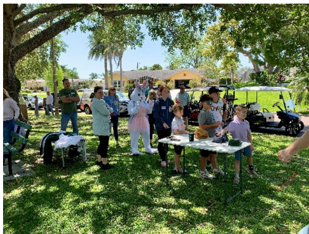
Kids lined up to take their shot at the Soaker