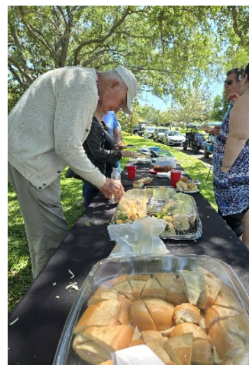
There was plenty of food for everyone